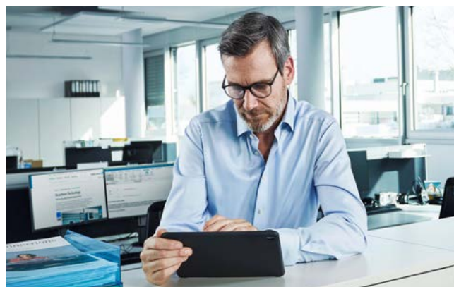
Memosens 2.0 is an excellent foundation for IIoT applications, enabling convenient remote access to your measuring points.

Netilion Value allows you to access your measured values at any time and from anywhere so you always know exactly what is happening in your plant. Digital access to this information means that you can manage the quality of your operating processes accurately – even remotely.