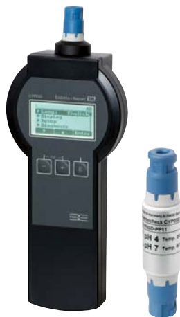
Service tools for the Memosens measuring point: Memocheck Plus and Memocheck Sim

Check your Memosens measuring point In the event of drifting measured values, Memocheck establishes if factors other than the sensor are the cause, such as the cable and coupling, the connection to the process control system or transmitter. With the Memocheck Sim handheld, you can define the values freely and simulate all sensors "speaking" Memosens protocol. Memocheck simulates defined measured values of the pH/ORP, oxygen, conductivity or chlorine parameters and a measurement error. This allows you to check your measuring point quickly and directly on-site. Validation and troubleshooting made easy.