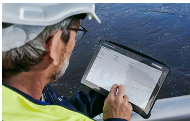
Netilion Value allows you to access your measured values at any time and from anywhere.